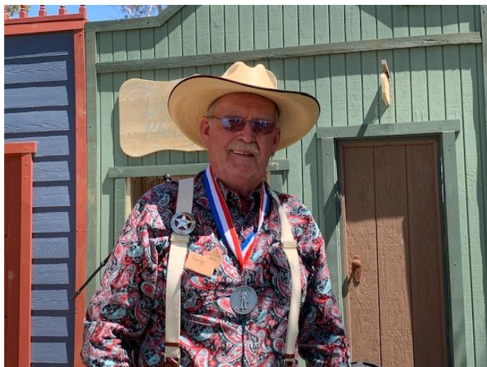
Fargo steps up to get his medal