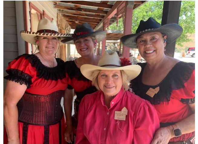
Ladies in red!