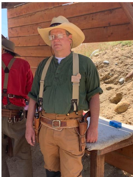
Waiting to shoot the speed pistol side match