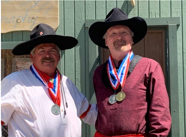
Tres Pinos & Coaltrain proud of their hardware