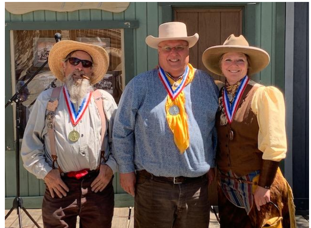
See you all at the May monthly match!