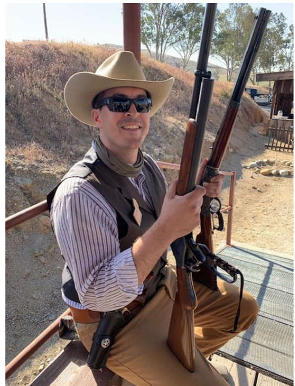
Tall Tale Todd