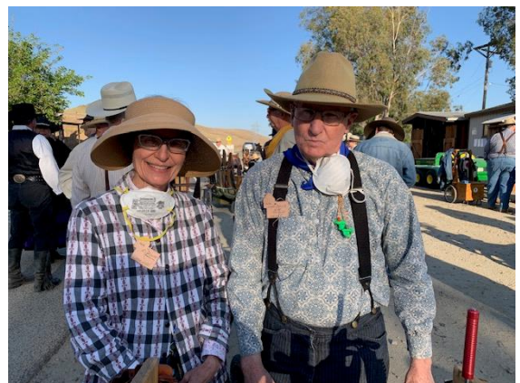
Misty & Dusty