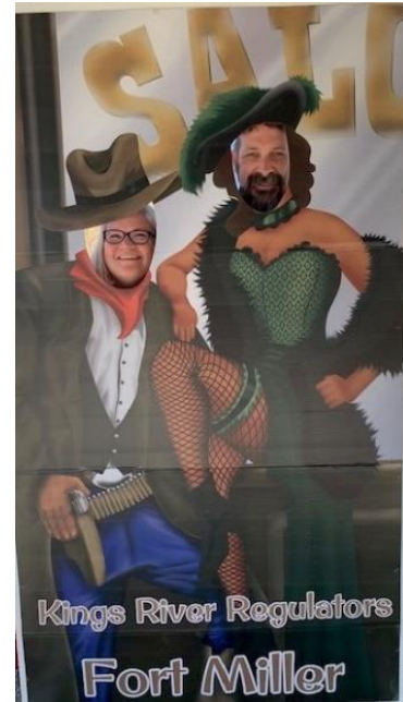
Well, I guess it really is the 21 st century...