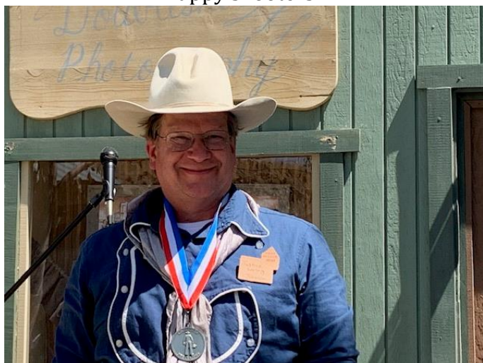
Justice is a happy B-western cowboy!