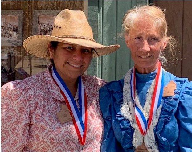
Legally Loaded & Manny's Granny