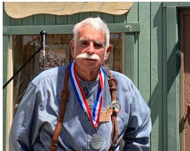
Slick Rock Rooster gets First Place!