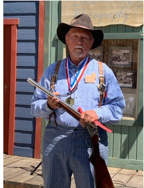
Blazin' Bill was the big winner of the much sought-after Stoeger grand prize! Congrats!!!