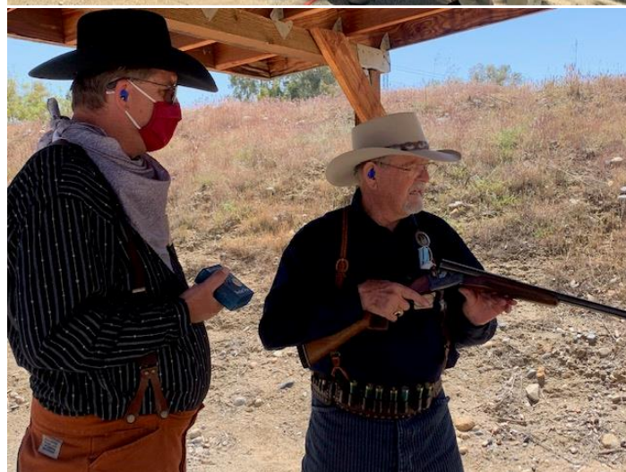
Snakebite ready to go!