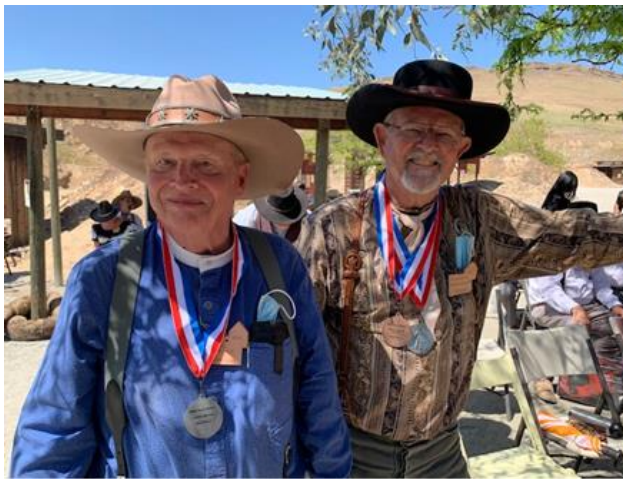
Sierra Rider & Snakebite – Happy medal winners!