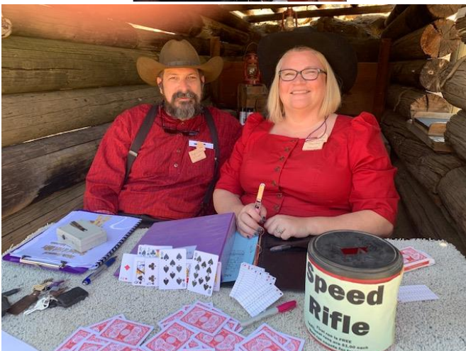
I think their "couple name" should be High Cotton Candy...